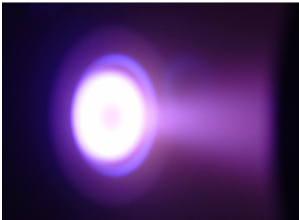
Photograph of a PVD Products 2-inch Titan Magnetron sputter source operating at 500 Watts and 5-mTorr of Argon gas with a Ti target.