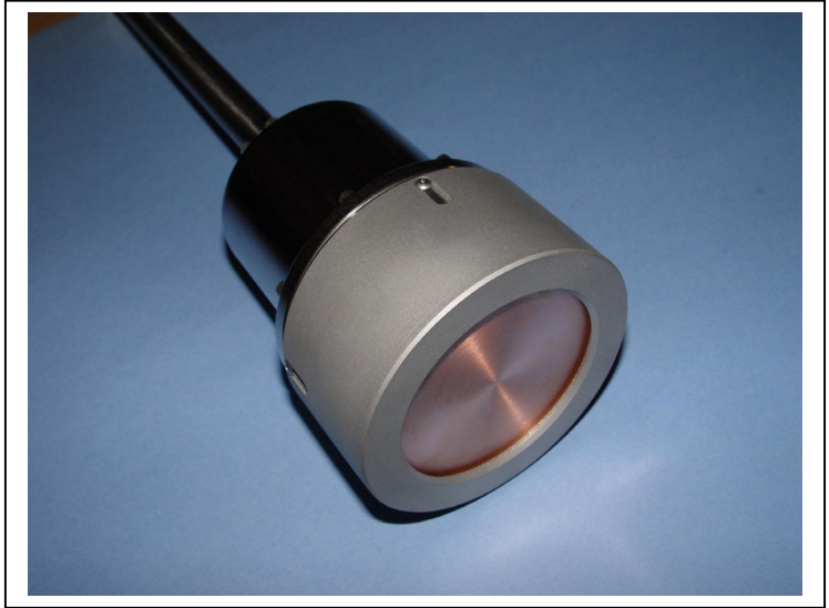
Photograph of a PVD Products Titan 3-inch Magnetron Sputter source.

PVD Products offers a full line of Titan planar magnetron sputter sources for your specific sputter deposition requirements. These magnetron sources are based on a field proven design-providing ease of use in a small volume with excellent target utilization and deposited film uniformity. All Titan magnetrons utilize vacuum brazed assemblies that eliminate all water-to-vacuum interfaces typically found in other sources. The Nd-Fe-B magnets are isolated from the water and are field replaceable. The sources operate with both RF and DC power supplies and are configurable for both balanced and unbalanced sputtering modes. Standard Titan designs come mounted on a 0.75" diameter shaft. Alternatively, sources can be made fully UHV compatible when properly mounted on customer specified conflat flange. Custom flanges with multiple sources are also available. Integral shutters, gas distribution, tilt mechanisms, chimneys, and Z-stages are all available as options.