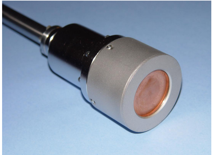
Photograph of a PVD Products 2-inch Titan Magnetron Sputter source.

Photograph of a PVD Products 2-inch Titan Magnetron sputter source operating at 100 Watts and 5-mTorr of Argon gas with a Ti target.