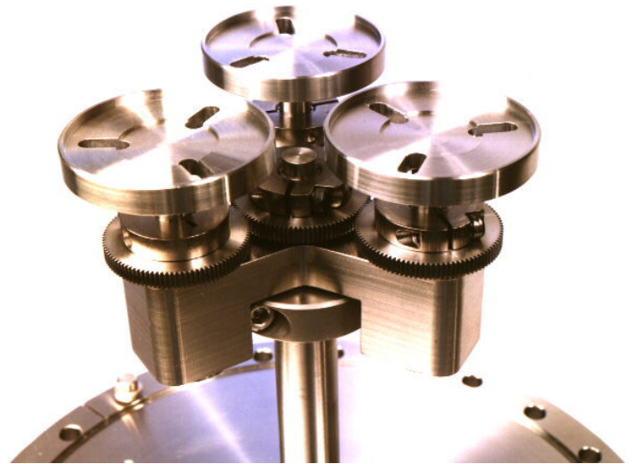
Horizontally oriented, 3-position, 50-mm \phi target assembly with top water-cooled shield removed mounted on 10" CF mother-flange.

PVD Products provides custom engineering for UHV PLD target manipulators to fit your deposition chamber. These manipulators are based on a single, co-axial, magnetically coupled rotary feedthrough. Target assemblies incorporate silicon nitride bearings and provide extended life even at high rotational speeds or high substrate temperatures. Hollow shafts on the target assemblies reduce heat transfer to the gears and bearings and provide for longer operating times. The feedthrough does not use any rotary-bellows seals, which might fail during continuous use. This manipulator requires only one penetration through the mother-flange, to provide more flexibility in properly locating the target assembly within your PLD chamber.