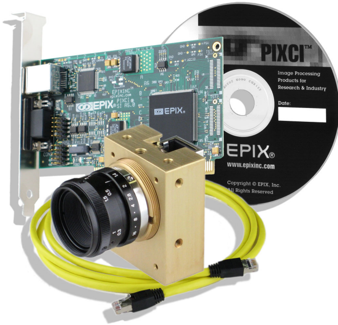
(Lens not included)