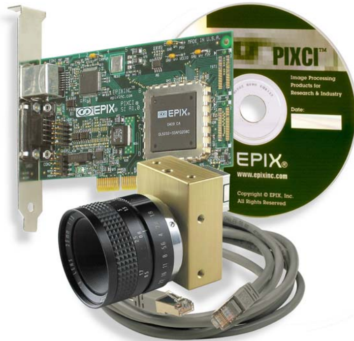
(Lens not included)