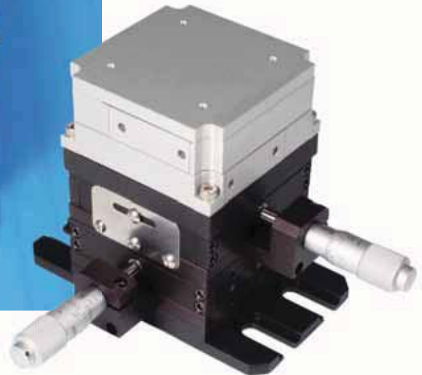
Nano-SPM200 shown with micrometer XY coarse positioning stage.

Examples, tutorial, and Nano-Route® 3D supplied with Nano-Drive® USB interfaces.