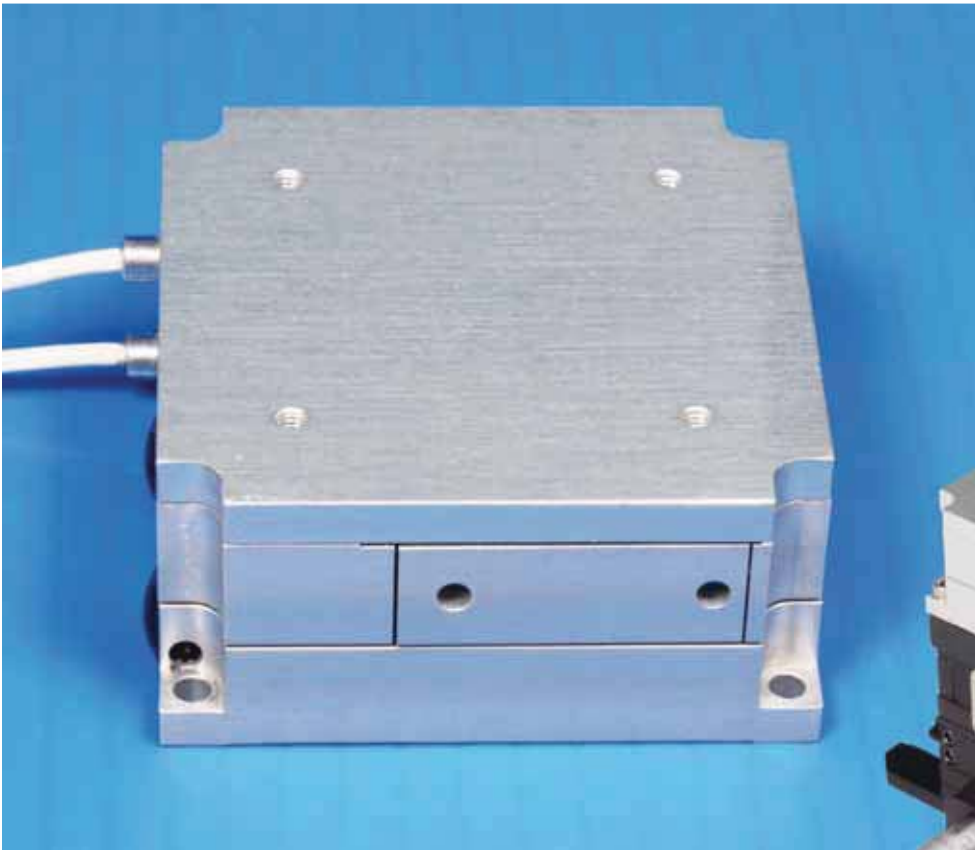
Nano-SPM200 made from aluminum.